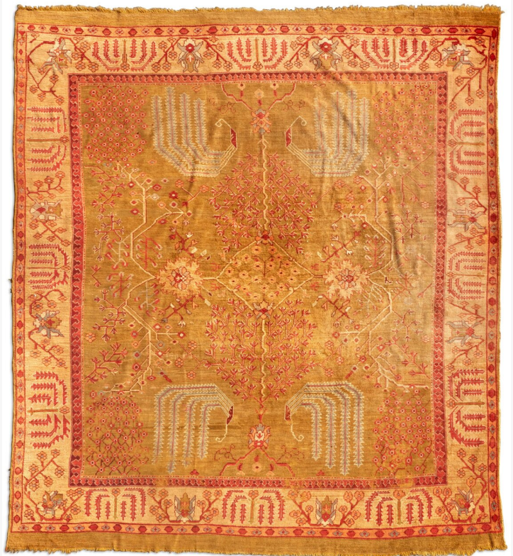
Oushak carpet, West Anatolia, approximately 12 feet 9 inches by 10 feet 11 inches ($10,625)