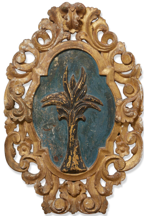
Early 18th century Italian Baroque parcel ebonized giltwood and blue painted oval plaque, 42 inches tall by 28 inches wide ($8,750).

This press release can be viewed online at: https://www.einpresswire.com/article/573185139