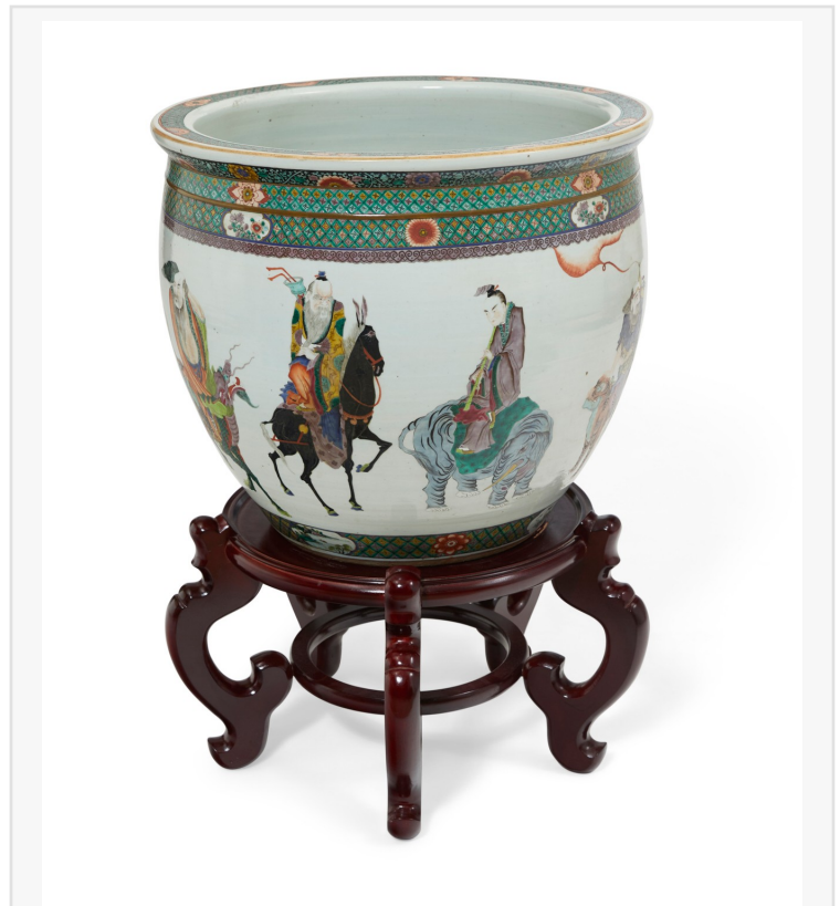
Chinese Export porcelain jardiniere on stand, overall height 30 ½ inches, 23 inches in diameter ($11,250).

Aileen Ward Andrew Jones Auctions +1 213-748-8008 email us here