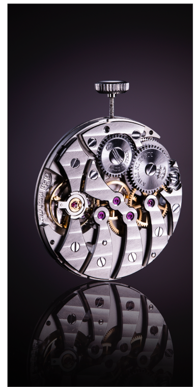
LOCMAN Montecristo OISA 1937