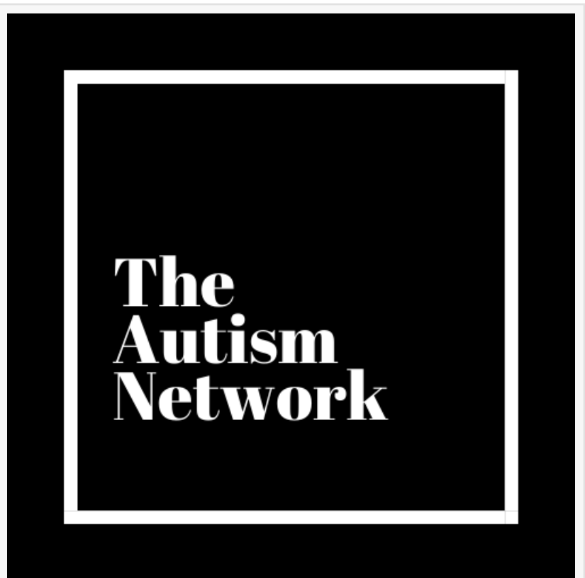
The Autism Network Logo