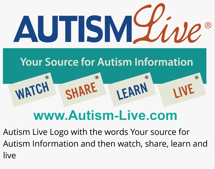
Autism Live Logo with the words Your source for Autism Information and then watch, share, learn and live