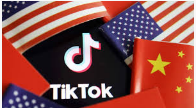
Tic Tok International Users Mailing List