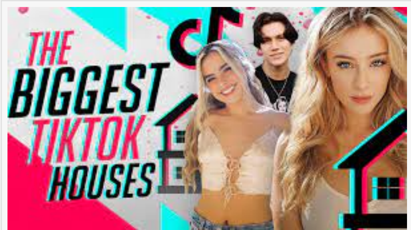
Reach This Active Audience of Tic Tok Users

Sprint Data Solutions Worldwide Marketing was the idea of a disabled veteran. After seeing to the completion of the responsibilities of military duty, the next step was to move from defense to economic growth, particularly the economy. This would be done by assisting the many businesses of the USA to find the clients or customers that are the foundation of solid growth. A