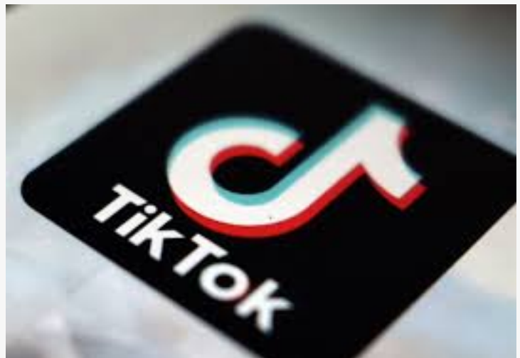
Tic Tok Accessory Buyers Mailing List