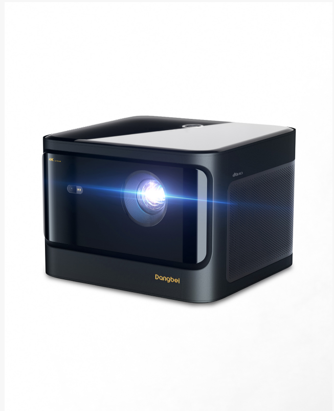
Dangbei Mars Pro 4k Projector

One of the first few things to notice is the image quality and display of pictures displayed. In this regard, the Dangbei Mars Pro projector has not only an ALPD laser fluorescence display but also has brightness as high as 3200ANSI lumens. In comparison to other projectors in the market, and according to its price point, this feature is a plus. Even in daylight, the image quality is distinct and clear, and bright enough.