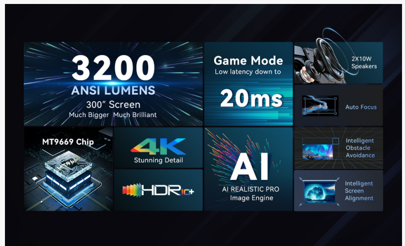
Dangbei Mars Pro 4K Laser Projector feature