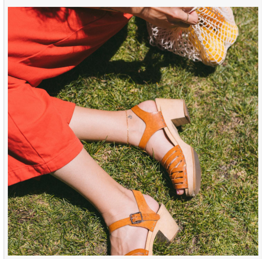
Permanent Anklet Being Worn

The Lovers Permanent Jewellery is Australia's first permanent jewellery only welding store. Female owned and run, since opening in 2021 it has had numerous accolades and been featured in write ups in Urbanlist, The West Australian, Broadsheet and PerthisOK.