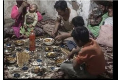
Hamdeli: "Four decades after the [1979] revolution led by clerics, the economic divide and misery have reached a point..."

The current circumstances indicate protests are expanding across Iran and the nature of this latest protest movement is highly explosive as millions of Iranians are barely making ends meet and literally feel they have nothing to lose.