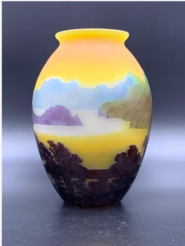
Galle cameo glass scenic vase of baluster form with an everted lip, the gray glass walls overlaid in multiple colors, with view of a mountain lake landscape, 8 ¼ inches tall (est. $1,000-$2,000).