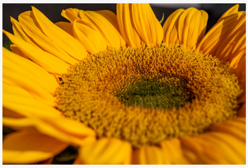
Close-up of a sunflower at Hana Field by Tanaka Farms in Costa Mesa.

reccomended. Also, bees love sunflowers, so if you have an allergy, beware that there will be a lot of bees on the premises. In addition to bees, farms do attract a lot of insects. If this is something that might bother you, make sure to use bug spray, or dress accordingly.