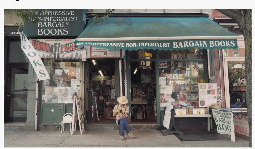
Scene from 34 Carmine St.

place that opens our eyes to massive inequality, but its culture also allows wealthy real estate managers to buy up land and drive out small shopkeepers.