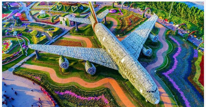
Dubai Miracle Garden Adventure Activities