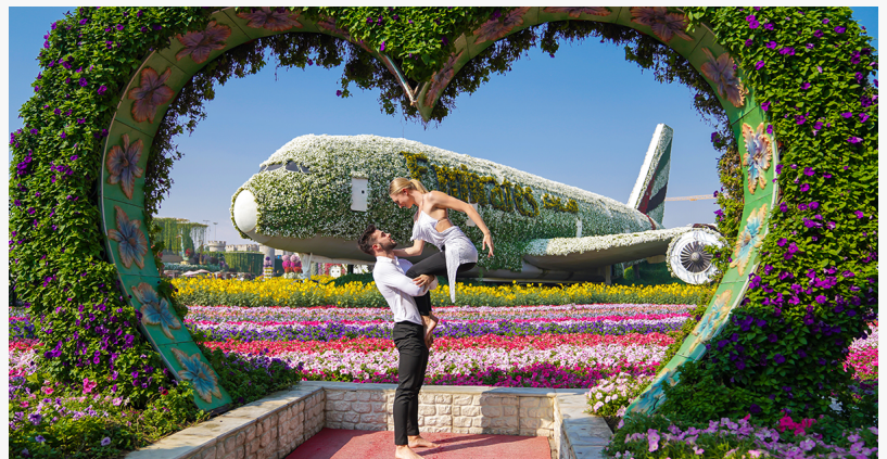
Romantic Places in Dubai