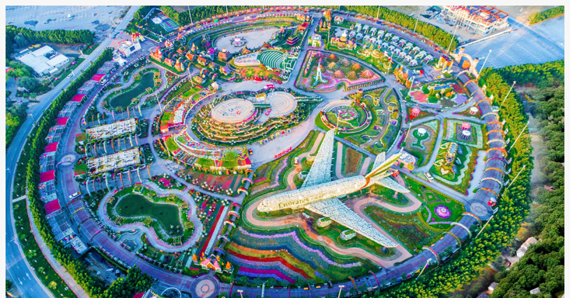
Dubai Miracle Garden-The Best Place to Visit in Dubai

This unmatched destination is undoubtedly a hidden gem in the midst of the wondrous city of Dubai and it leaves its visitors completely awestruck. However, not many people know about this amazing destination. This is what needs to change and