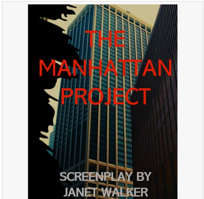
The Manhattan Project First Look Poster