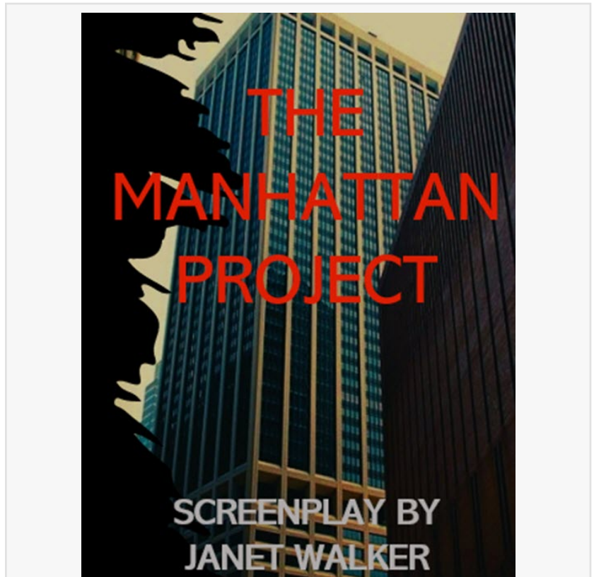
The Manhattan Project First Look Poster