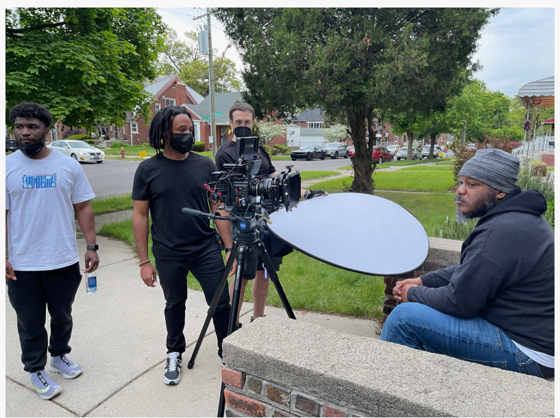
A photo from the set of Full View Production's narrative short film, DERRICK

Rachel Washington Full View Productions +1 313-355-6900 email us here