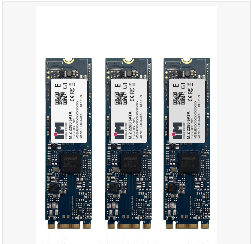
Intelligent Memory offers a broad range of DRAM Modules

Ortrud Wenzel Intelligent Memory email us here