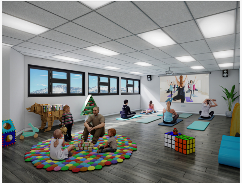
of New Multipurpose Room