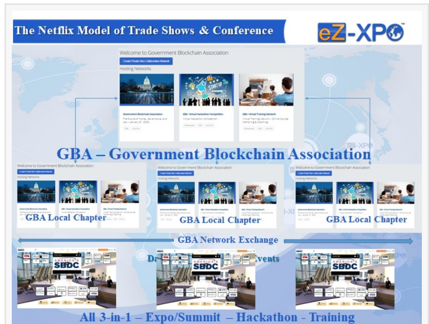
GBA - Virtual Collaborative Network

The Government Blockchain Association (GBA) is an international nonprofit professional association with its headquarters located in Fairfax, Virginia. GBA focuses on its members as individuals and organizations that are interested in promoting blockchain technology solutions to the government but does not advocate for any specific policy position. Membership is available to government employees along with student organizations, private sector professionals, and corporations. Membership fees are waived for government employees.