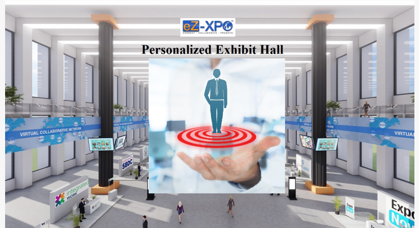
Virtual Exhibit Hall