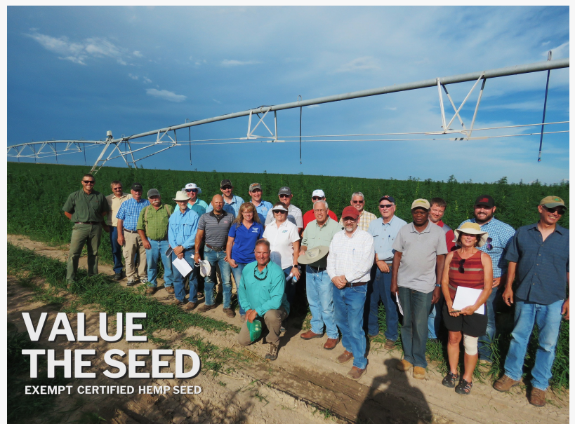
Members of AOSCA visiting a field of Certified industrial hemp seed production in Colorado.

Promote a strong industry foundation: Value the seed, value farmers, an reduce regulatory burden!