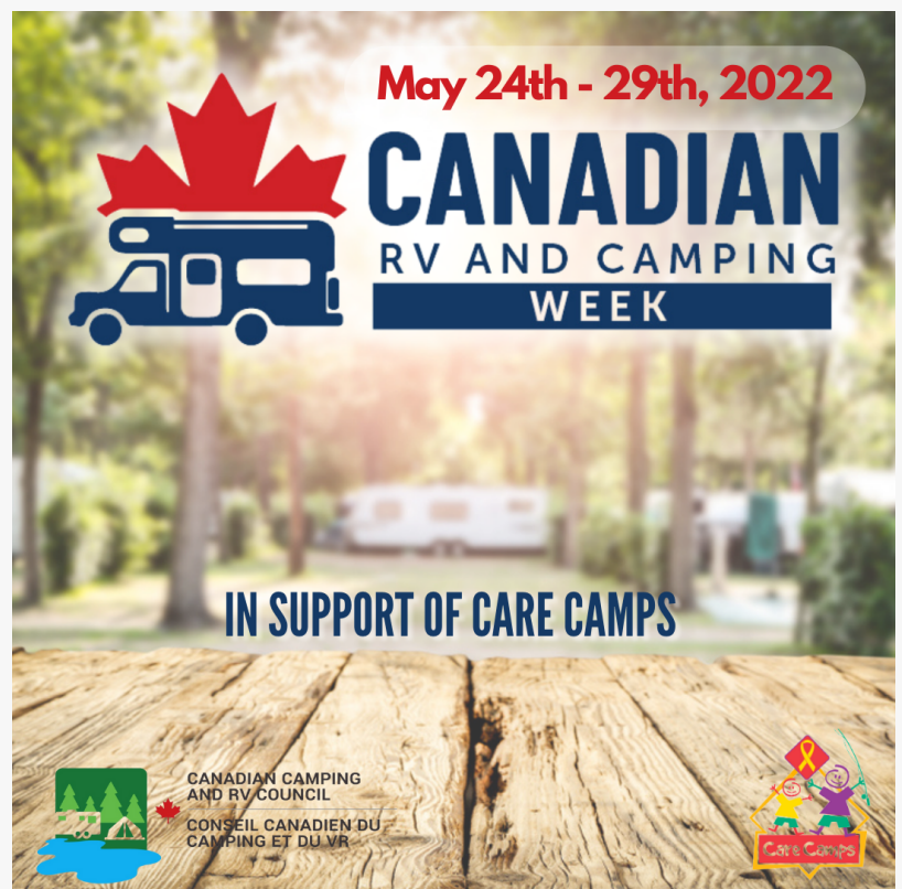
Canadian Camping and RV Week

For the past several years, Canadian RV and Camping Week has marked the official kickoff of Canada's summer camping season and this year Canadian Campground Owners will put