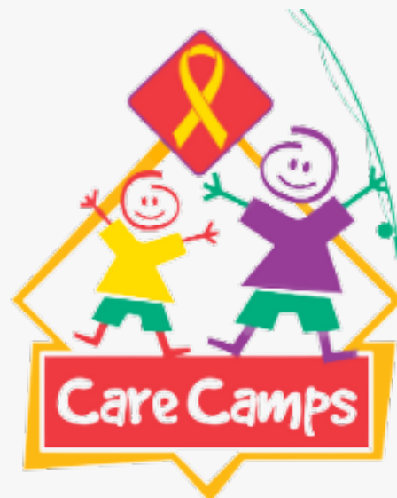
In support of Care Camps