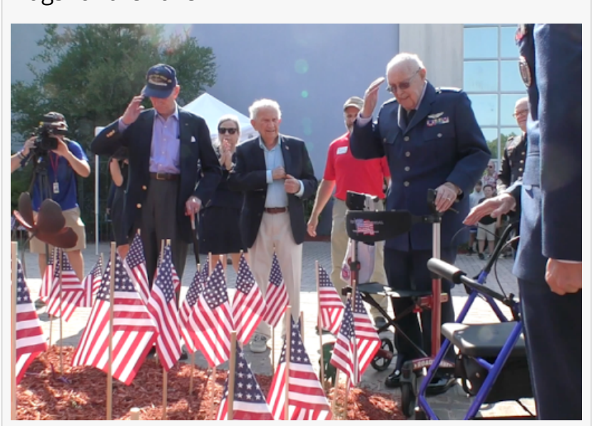
Honor given to the Fallen

Force's WWII fallen airmen by name, bomb or fighter group, and date of death.