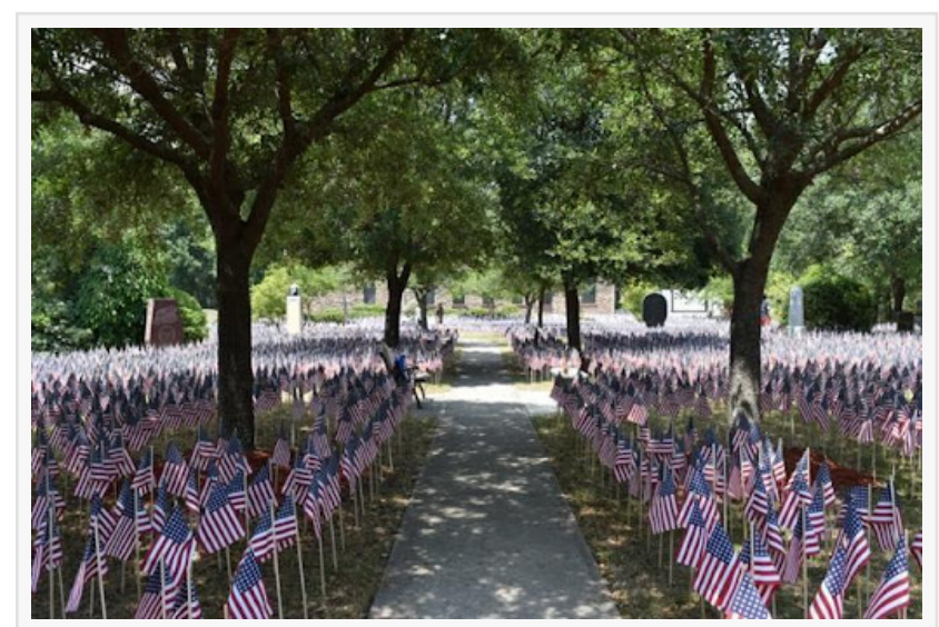
Flags for the Fallen

A "Roll Call for the Fallen Eagles" will be broadcast throughout the garden, <u>calling the names</u> of the Eighth Air