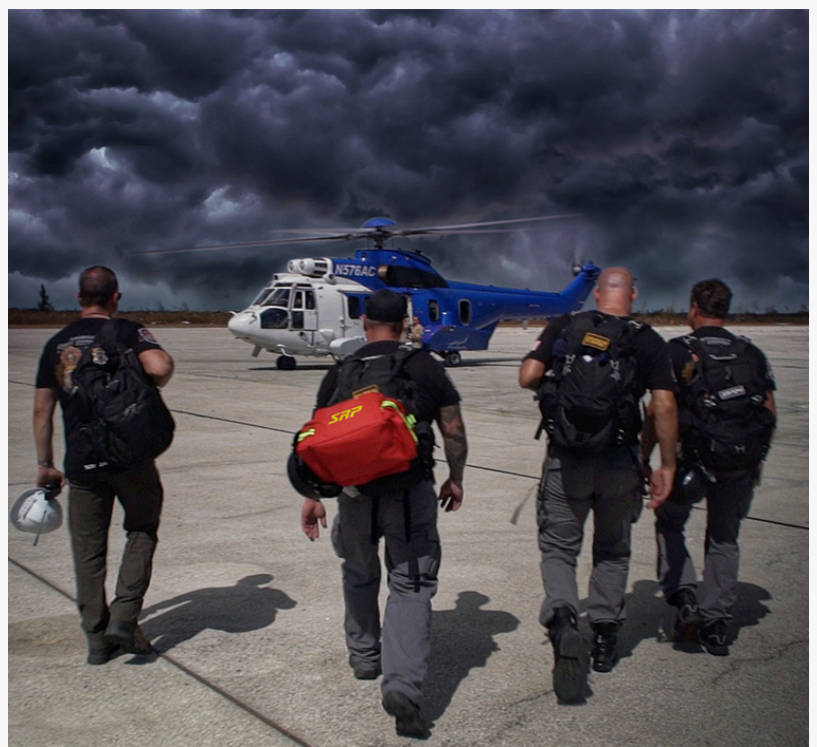
SRP team responding in a time of need

Guided by its mission to help people and businesses mitigate damage in the face of natural disasters, SRP offers a highly-trained team that can help clients establish or update a well-vetted disaster plan that can be designed and implemented for various scenarios. SRP boasts a robust