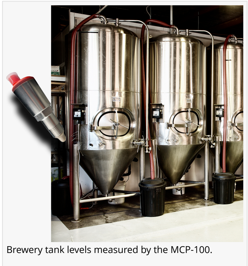
Brewery tank levels measured by the MCP-100.

These small, but mighty level gauges, include a colorful LED status display which you fully control using your phone and an app through Bluetooth. Install an MCP-100 as a low or high-level detector in a tank. The sensor settings can be adjusted using a phone app. Colors, blinking, and other features can be completely customized for optimal operation.