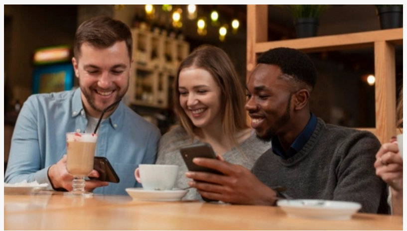
See Detroit videos 24Hours/Day!

JB Wheeler Easy Mobile Advertising of Detroit +1 888-348-3778 jb@easy-mobile-advertising.com Visit us on social media: Other