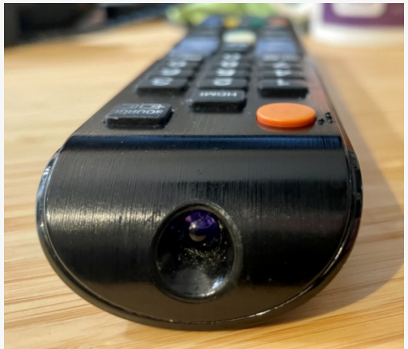
Watch 24Hour-Detroit on phones, laptops & TV's!