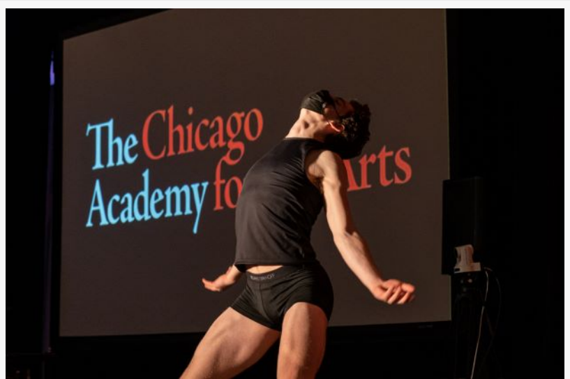
Musical Theatre performance at Chicago Academy for the Arts 40th Anniversary Gala on May 14, 2022 at Chicago's Radisson Blu Aqua Hotel. | ChicagoAcademyForTheArts.org

CHICAGO, IL, USA, May 31, 2022 /EINPresswire.com/ -- For four decades, The Chicago Academy for the Arts (The Academy) has provided world-class education for aspiring young artists in the fields of music, dance, theatre, media arts, musical theatre, and visual arts. As one of Chicago's leading arts and culture high schools, and one of the most diverse schools in Illinois, The Academy created an unmatched and transformative educational model. Students are inspired to expand their potential through rigorous arts training paired with an esteemed academic curriculum.