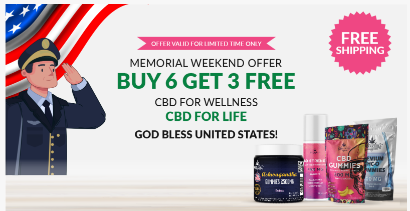
Memorial Day Offer