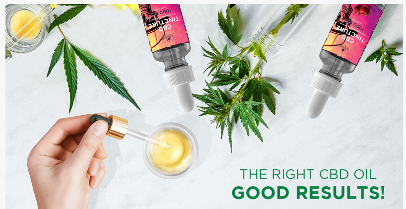
The Right CBD Oil