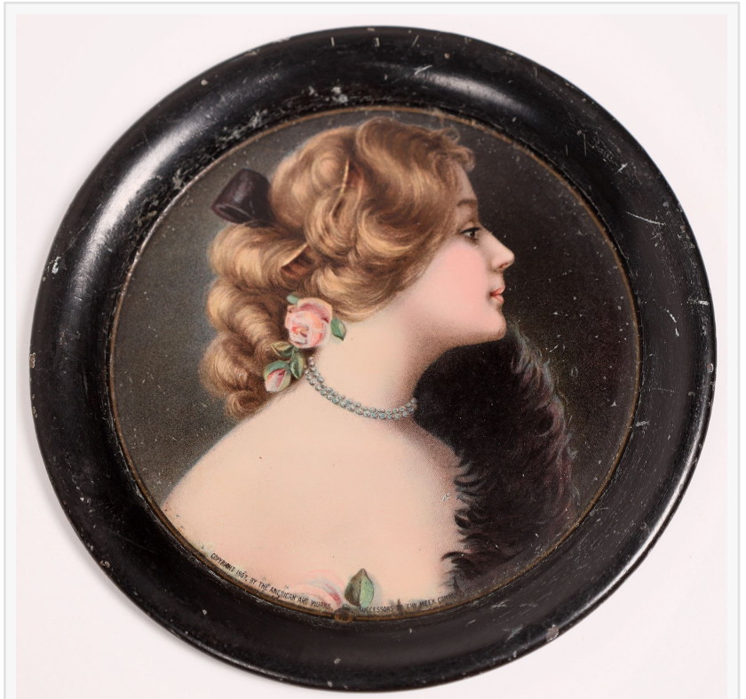
Vintage metal tip tray, most likely from the late 19th century, circular, about 4 ¼ inches in diameter, with an image of a young woman with flower earrings (est. $100-$150).

A Day 1 highlight lot is the group of six framed Thomas Kinkade reproduction prints, not signed or numbered. These are reproductions of paintings of cottages, bridges, and landscapes. There is a seventh print that is not a Kinkade. It is a reproduction of a painting of a Texaco gas station and general store in a rainstorm. All of the prints are beautifully matted and framed. Overall sizes vary from about 16 ¾ inches by 13 ¾ inches to 24 ¼ inches by 20 ½ inches (est. $300-