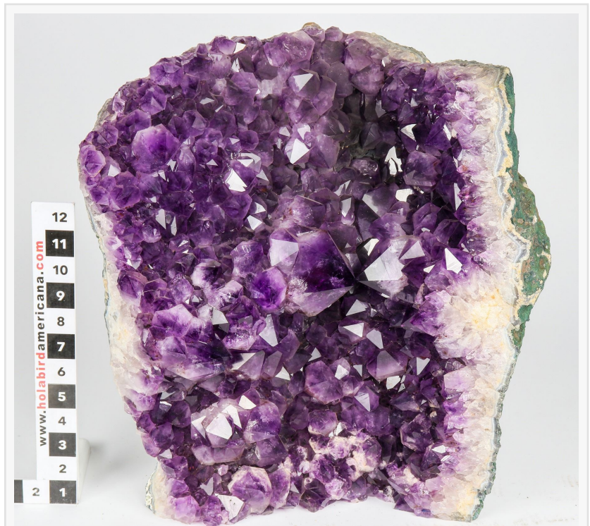
Large amethyst cavern geode, containing large deep purple amethyst crystals from ½ inch to 3 inches across, 15 inches by 18 inches, from the Chunlin Zhu collection (est. $2,000-$3,000).

Also being offered on Day 3 are two lots from the Chunlin Zhu collection: a gorgeous carved wood tiger boasting a high polish, 48 inches by 36 inches by 16 inches; and a large amethyst cavern geode , containing large deep purple amethyst crystals from ½ inch to 3 inches across, 15 inches by 18 inches by 11 inches. Both lots carry identical pre-sale estimates of $2,000-$3,000.