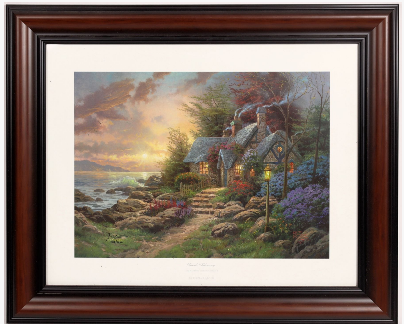
Group of six framed Thomas Kinkadee reproduction prints, not signed or numbered. These are reproductions of paintings of cottages, bridges, and landscapes. A seventh print is not a Kinkadee (est. $300-$400).