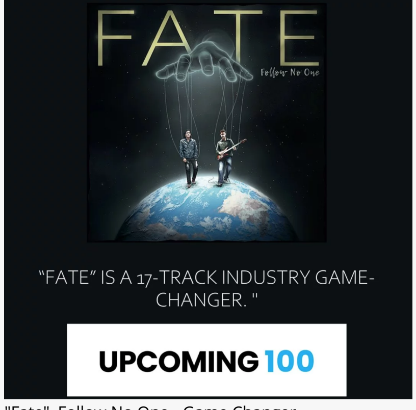
"Fate", Follow No One - Game Changer