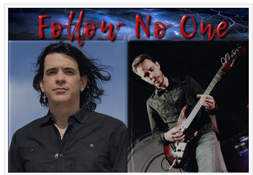
Follow No One "Fate"

DENVER, COLORADO, USA, May 24, 2022 /EINPresswire.com/ -- Calling All Rock Fans! The award-winning rock duo: Follow No One, breaks all industry norms with the release of "Fate," a modern cinematic rock concept album that brings back the magic of Rock. Described as a cross between Queensryche and Styx on a hard rock foundation; Follow No One draws from the purest classic and raw hard rock