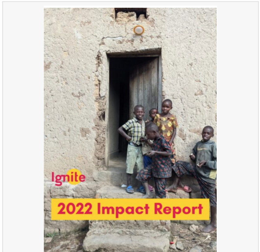
Impact highlights report 2022