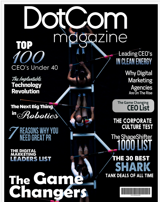
The DotCom Magazine Game Changers Edition

DotCom Magazine is a leading news platform