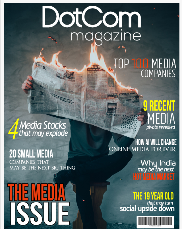
The DotCom Magazine Exclusive Entrepreneur Spotlight Series