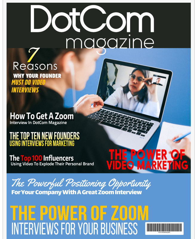
The Power Of Zoom Interview Issue