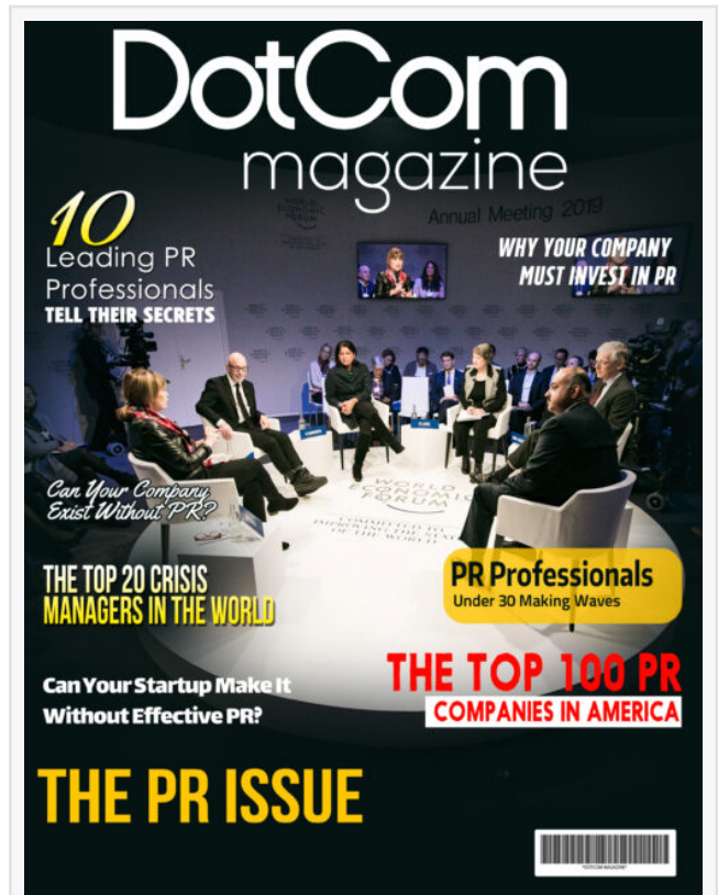
The DotCom Magazine PR Issue