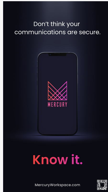
Mercury Workspace - How Smart Business Communicates

"Executives go to bed at night hoping that their company data and communications are secure. With Mercury they can sleep soundly knowing that the messages and files