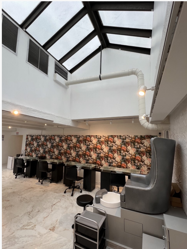
Luxury at Laveda Lash & Brow Boutique

For more information, logon to https://www.lavedaboutique.com/ or call 301-969-5659.