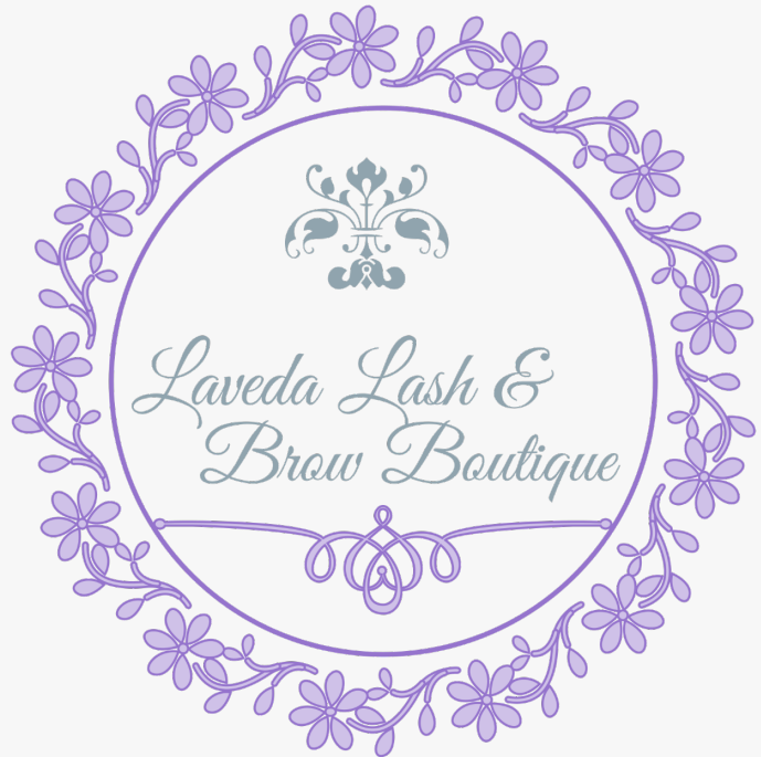
Laveda Lash & Brow Boutique Logo

Lashes and eyebrows are big business, with the average woman waxing or tweezing every two