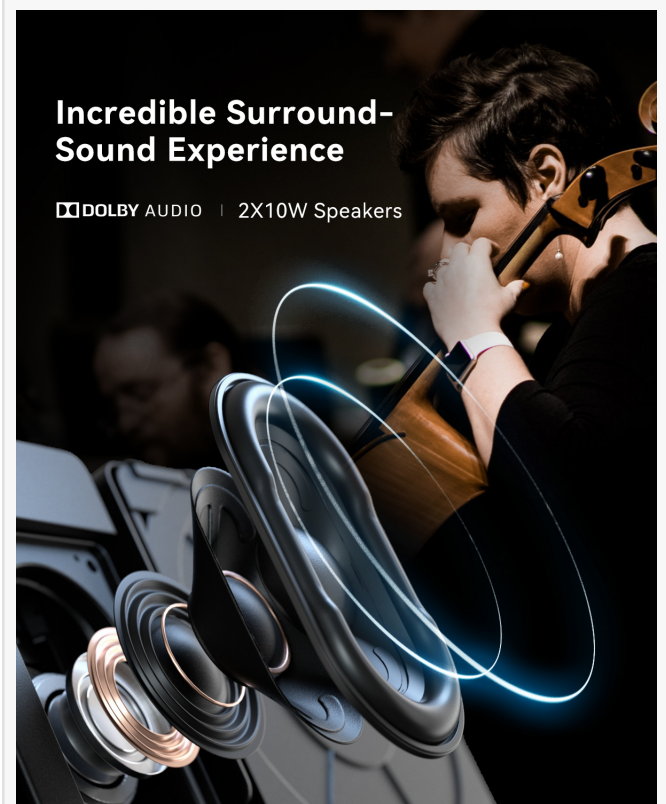
Dangbei Mars Pro 4K Laser Projector 3D Explosive map sound quality