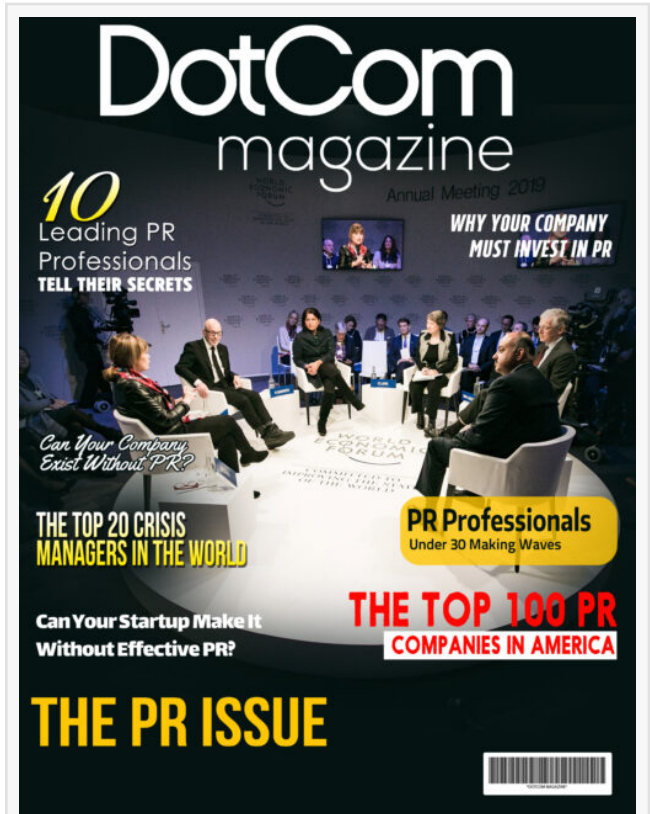
The DotCom Magazine PR Issue