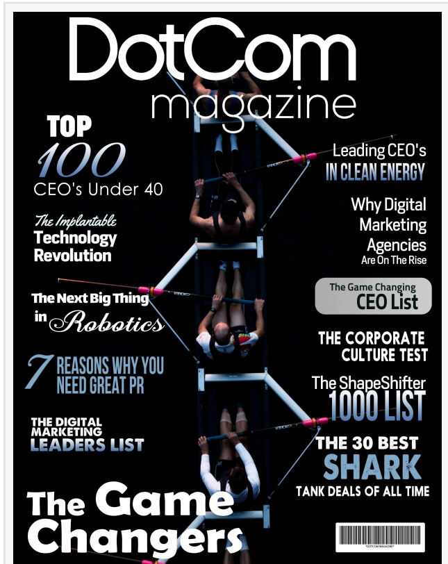
The DotCom Magazine Game Changers Edition