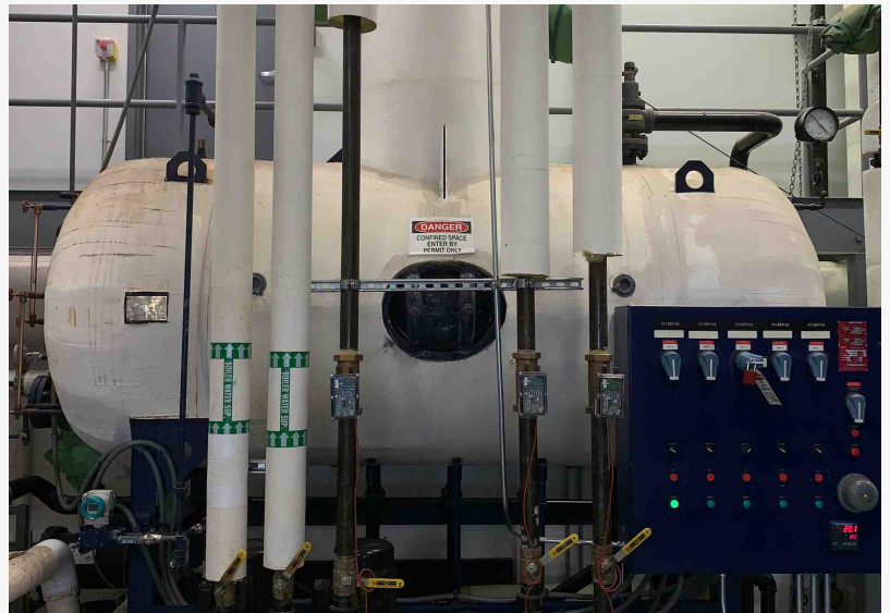
Storage tank example