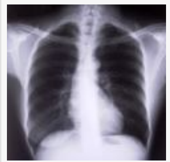
A normal heart