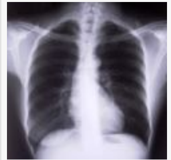
A normal heart