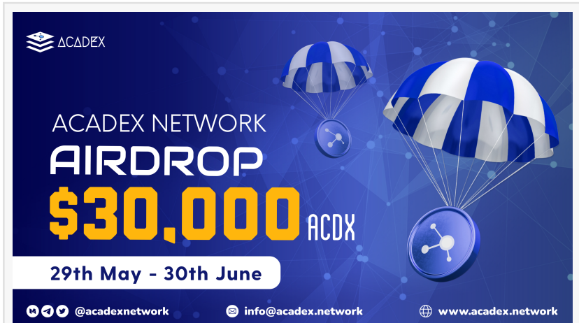
Acadex Network Airdrop

The unraveling of the ACDX token utility in the spread of AMA sessions held across communities has never seized to be a jaw dropping moment. Sparking enthusiasm from all quarters, the network in one of its public outings, aced an oversubscribed sale in a matter of minutes. For the majority, familiarizing with the educational transcendence and business model the network embodies, was sure to instill fervor and trust in the Acadex vision.