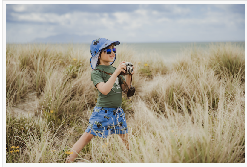
Snapper Rock Surf Safari

Snapper Rock's award-winning swimwear will also add new sustainable options in its Summer 2023 collection, demonstrating the brand's commitment to looking after