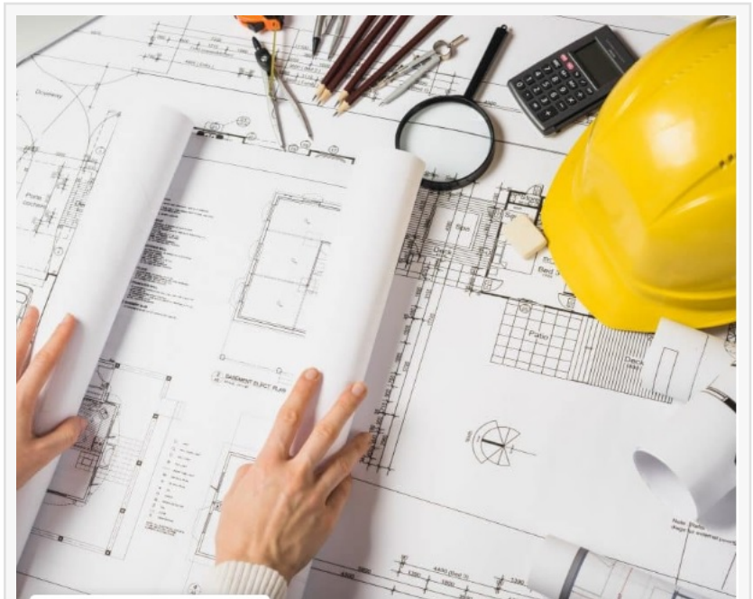
Permit Inspection in DC