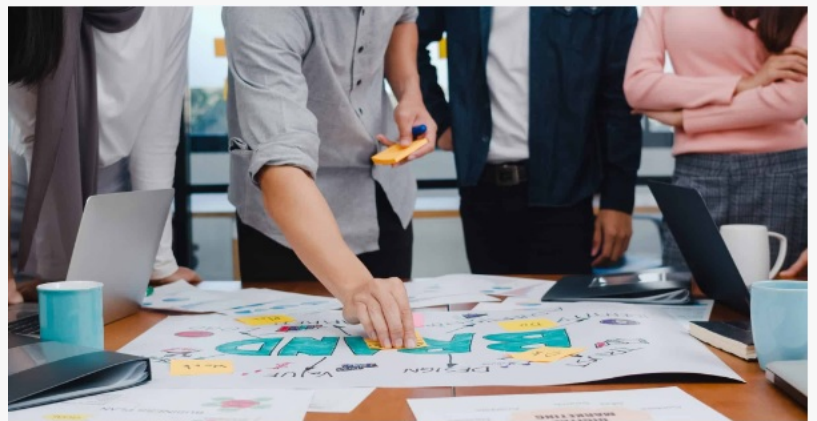
Outsource Permit Expediting Needs from Tejy Inc.