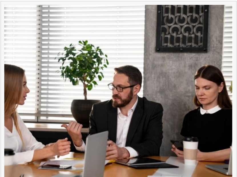
Commercial Construction Permit Expedition

Whenever necessary, Tejy permit facilitators in Washington DC collaborate with the employees of the local jurisdiction, including Code Enforcement, to find solutions to any issues that may occur before or during the building permit process. Though these tasks are simple to execute, they are frequently missed and not finished on time. Tejy Inc. BIM Engineering and Permit Service Company not only oversees each stage of the procedure but strives to complete them as quickly and professionally as feasible.