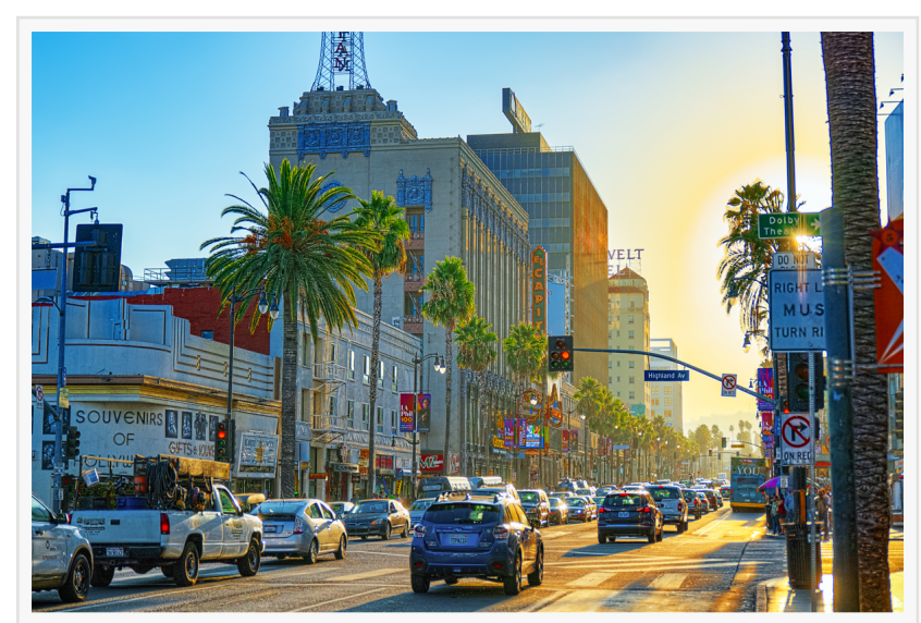
Urban Digital Twin pioneer Cityzenith announces pivotal 'Clean Cities – Clean Future' project in Los Angeles

Los Angeles' Better Buildings Challenge, a community of building owners representing 150 million ft<sup>2</sup> of commercial real estate space committed to 'going green', has partnered with Urban Digital Twin pioneer Cityzenith.