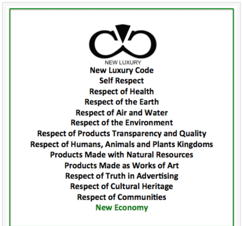
The New Luxury Code

The inhabitants of Murano owned a golden book to write down the families originating from the island. The girls could marry noble practitioners of Venice and their descendants were noble even if they were glassmakers. At the beginning of the 13th century, the Island of Murano led the trade of Venetian glass and the production of pearls and bottles. The Mission of the International Perfume Foundation is to protect the heritage of Perfume. Murano is part of it “