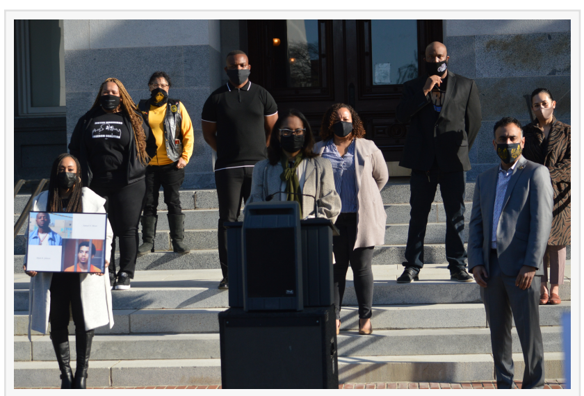
Senator Sydney Kamlager w/ ACA3 California Abolition Act Coalition

SACRAMENTO, CA, USA, May 30, 2022 /EINPresswire.com/ -- On Tuesday May 31, 2022 at 1:30pm on the West steps of the California State Capitol, The California Abolition Act Coalition along with The California Reparations Task Force, legislators and bill co-sponsors will hold a press conference prior to the scheduled Senate Public Safety hearing at 3pm. Samual Nathaniel