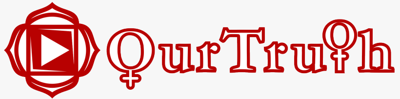
Our Truth Logo

The Natural TV Channel's approach is to offer an unsurpassed wellness experience through providing programming with regards to comprehensive natural health information, interviews with leading health practitioners, and interviews about 100 percent natural and environmentally responsible products for family, household and pets. Whether searching for nutrition, wellness, disease management, or condition-specific solutions, Natural TV Channel will