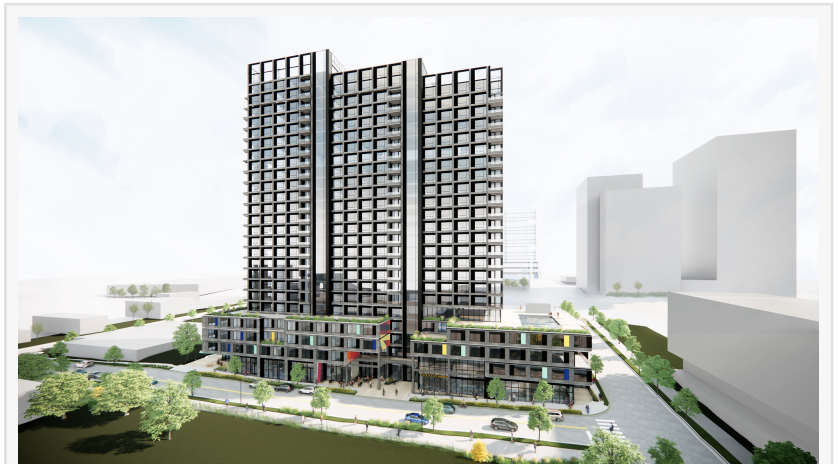
Concept rendering of proposed class A multi-family building.

/EINPresswire.com/ -- T2 Capital Management, LLC is pleased to announce the acquisition of 621-633 Middleton Street, a 1.2-acre parcel in the Pie Town sub-market of downtown Nashville, Tennessee. T2 plans to continue the ongoing enhancement of the burgeoning community with the construction of a class A multi-family residential building.