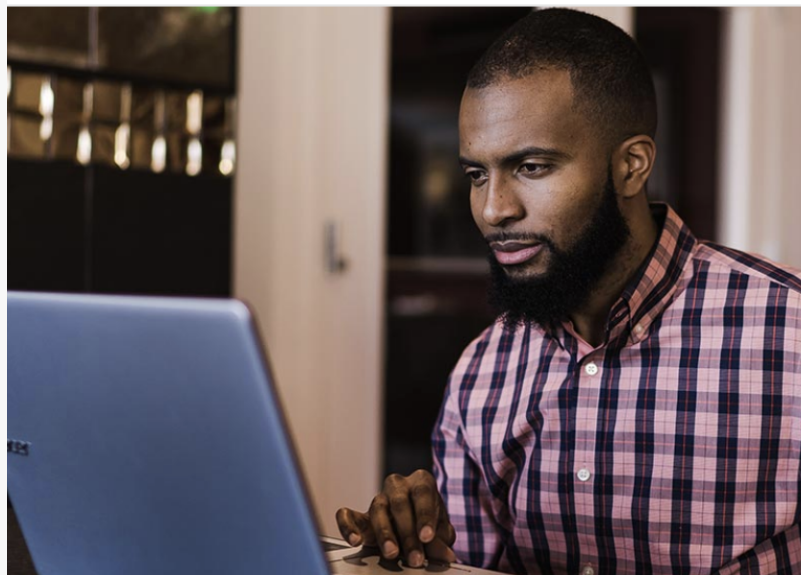
Diverse & Remote Workers

This press release can be viewed online at: https://www.einpresswire.com/article/574781511