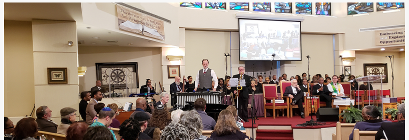
The Jazz Sanctuary brings live jazz music performances to audiences across the Greater Philadelphia region.