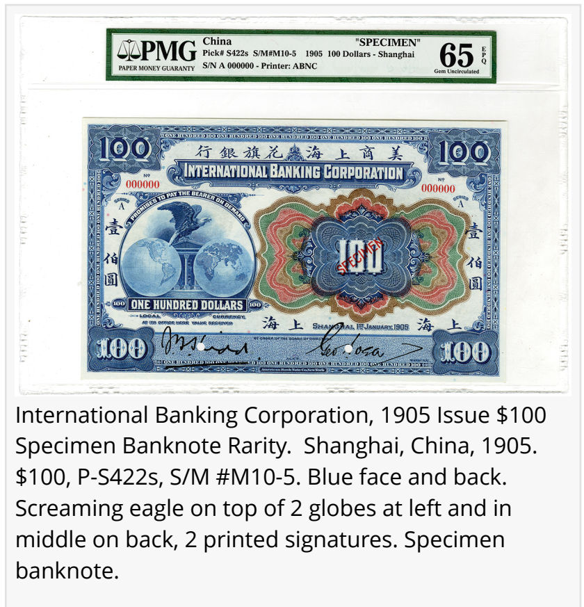
International Banking Corporation, 1905 Issue $100 Specimen Banknote Rarity. Shanghai, China, 1905. $100, P-S422s, S/M #M10-5. Blue face and back. Screaming eagle on top of 2 globes at left and in middle on back, 2 printed signatures. Specimen banknote.

banknotes, an International Banking Corporation, 1905, $100, P-S422s in PMG 65 EPQ and also a