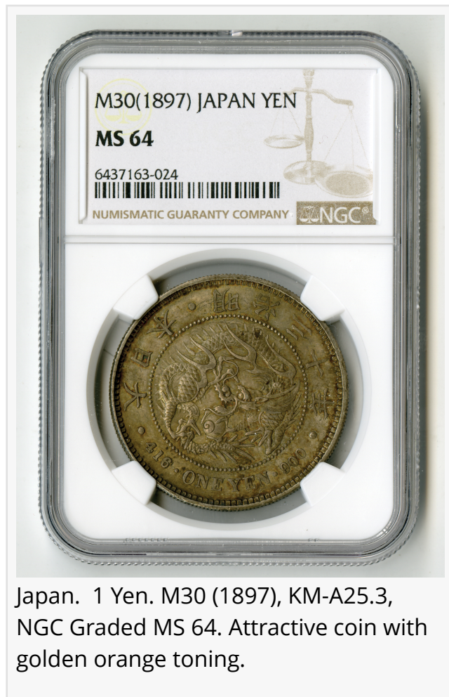
Japan. 1 Yen. M30 (1897), KM-A25.3, NGC Graded MS 64. Attractive coin with golden orange toning.