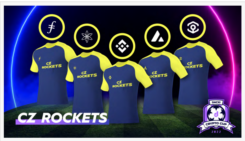
Dacxi Crypto Cup Competition