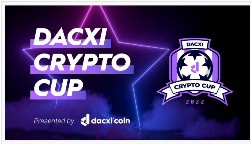
Dacxi Crypto Cup Competition

Starting 8 June 2022 and running for a total of ten action-packed weeks, the competition will see 40 coins take the field in eight five-a-side teams. There'll be a new game each week, running from 12am Monday to 11.59pm