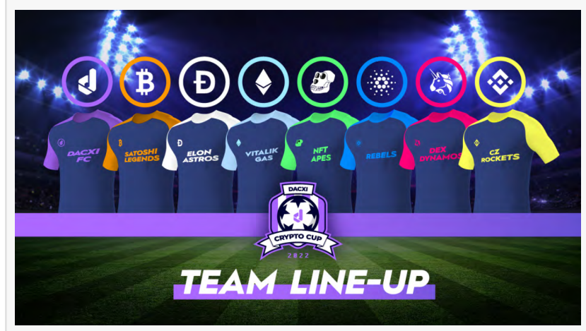
Dacxi Crypto Cup Competition

Sunday GMT. Winners will be determined by the total aggregate increase (or loss) in the team's value over the course of the week.