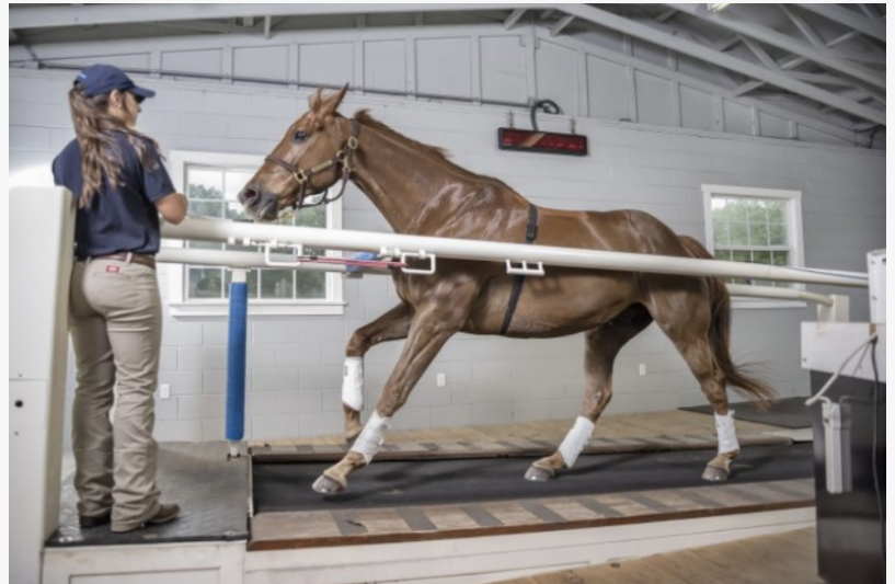
High speed treadmill at Exceed Equine's facility in New Egypt NJ

This press release can be viewed online at: https://www.einpresswire.com/article/574868043